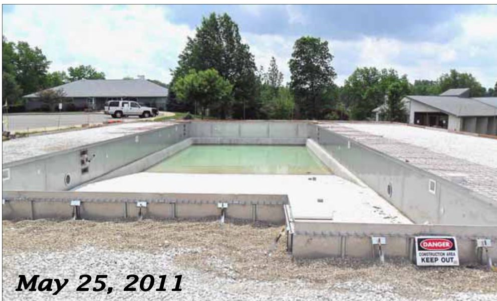
May 25, 2011